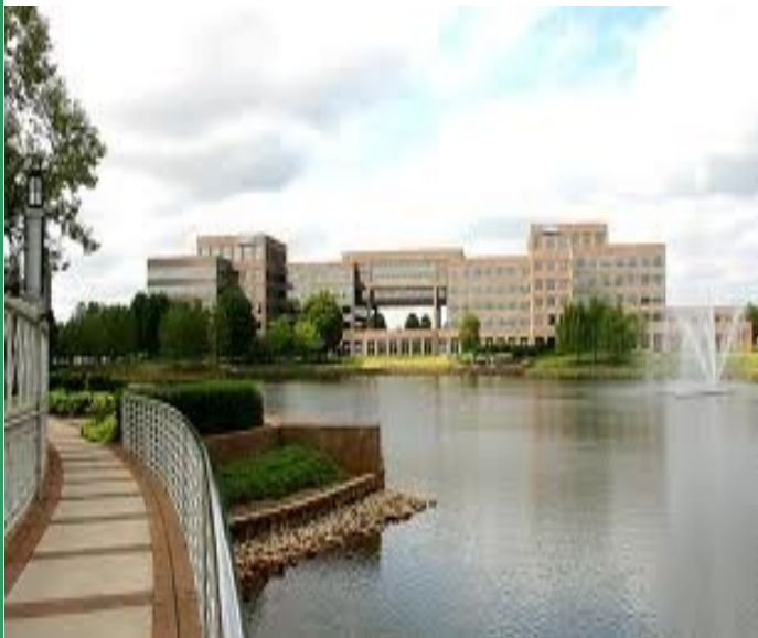
ADTRAN, Inc Headquarters, Research Park, Huntsville, Alabama