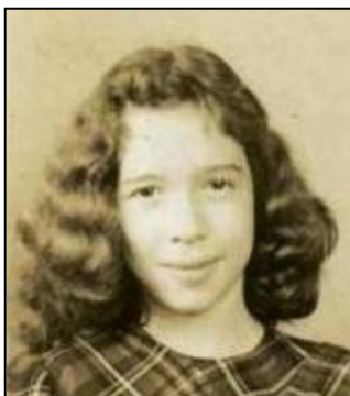
School Days 1948-1949

Her favorite pastime was skating at the old Busby